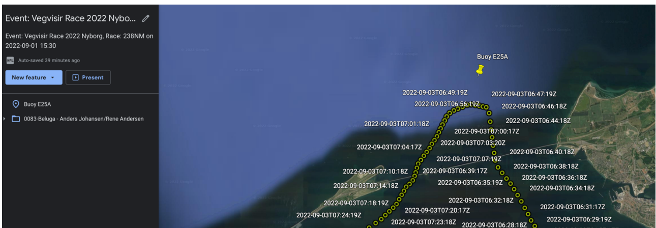
Raw data from tractrac showing time stamped positions